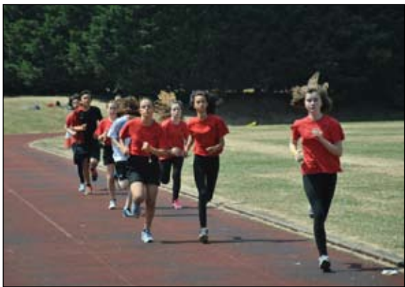
Despite searing temperatures 13 records were shattered at the SNS 2013 Sports Days . . .