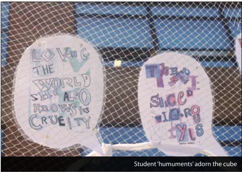
Student 'humuments' adorn the cube