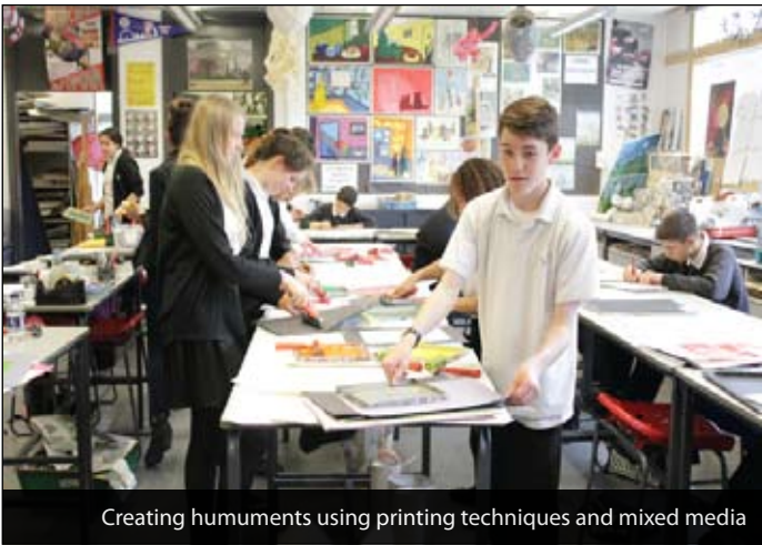
Creating humuments using printing techniques and mixed media