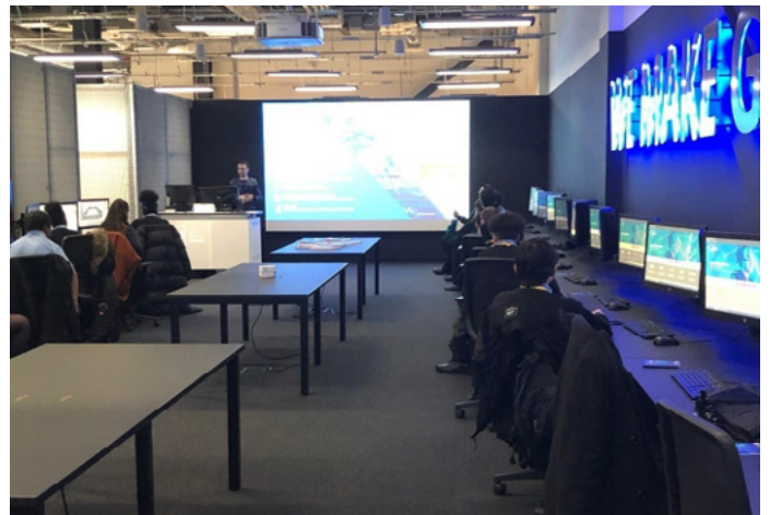
Year 11 on a visit to E Sports at Staffordshire University (Here East campus)

As always, our latest creative day featured a range of activities to engage students in activities that fall outside the remit of the everyday curriculum.